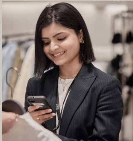
SAVING & FINANCES