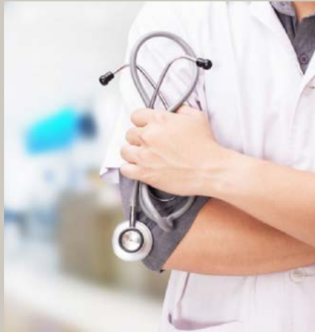
HEALTH & WELLNESS